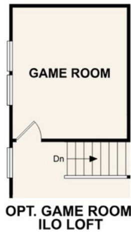
OPT. GAME ROOM ILO LOFT