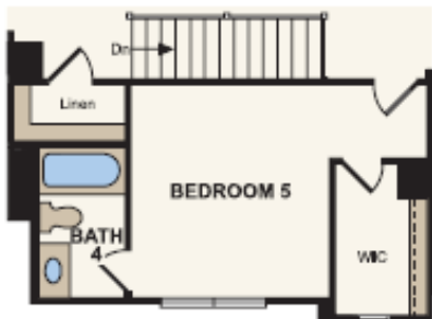
OPT. BEDROOM 5/BATH 4